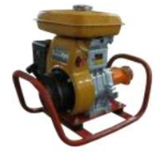
DU5/EY20DU Subaru Robin