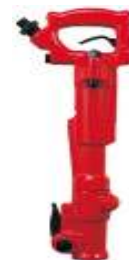
TCD-20 - 10kg