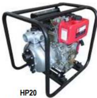
HP20 2" High Pressure Pump