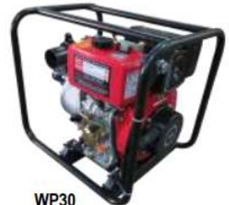
WP30 3" Self-Priming Pump