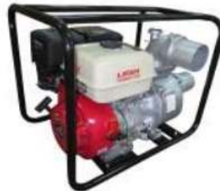
100ZB26-7.5Q 2" Self-Priming Pump