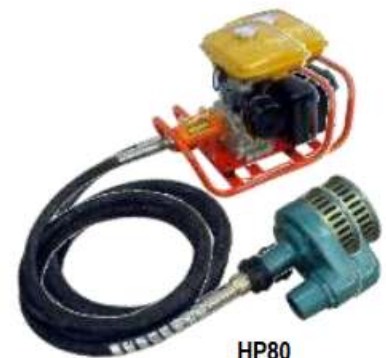
HP80 3" Submersible Pump