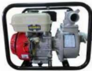
50ZB26-4Q 2" Self-Priming Pump